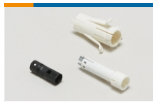
Plug &amp; Socket Lighting Connector Accessories(57)