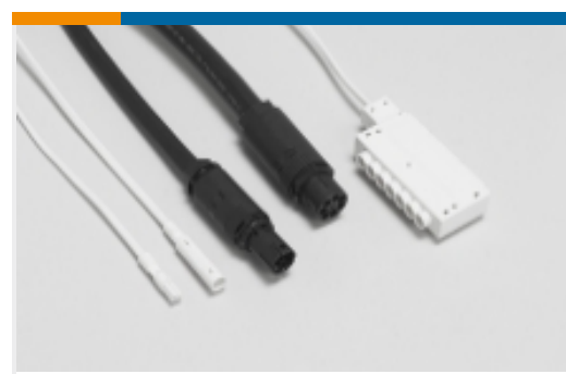
Lighting Cable Assemblies(1)